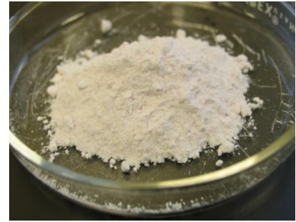
Nd-Pr oxide powder: HDD

Within the crosscutting focus area, INL is pursuing research in the areas of environmental sustainability and supply chain and economic analysis. Under environmental sustainability, INL is working on the treatment of mineral processing waste streams through improvement and development of filtration technologies that extends operational lifetime of equipment by reducing fouling. Demonstration of hydrophobic surface modification and embedded membranes has been successful. Research has been carried out with Molycorp, Inc., and Graver Technologies.