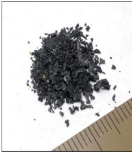
Metallic Nd-Pr: Neo magnets